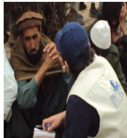
GPP Staff Interviewing the IDP