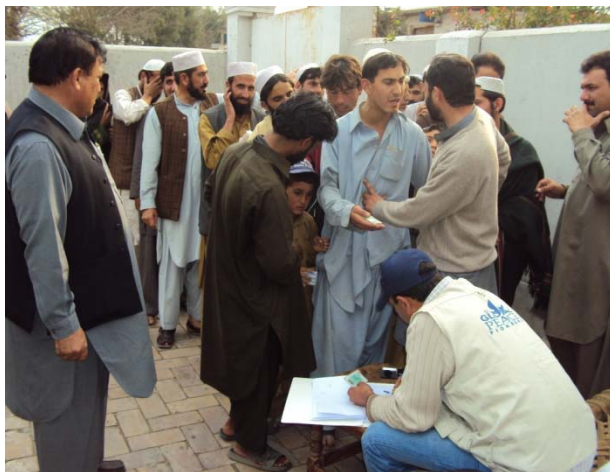
GPP Staff along with Social Welfare Office Staff for IDPs Receiving NFI Kit and Blanket in Kohat district