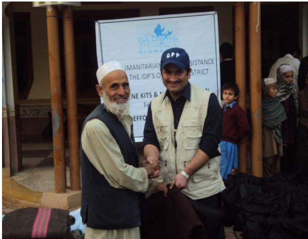
IDP from Terah settled in Kohat District receiving NFI Kit