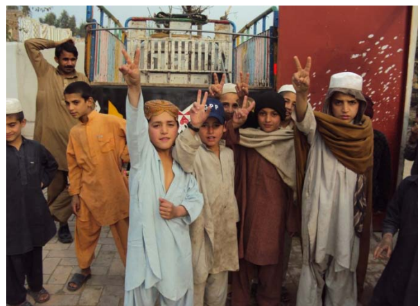
IDP Children after the distribution