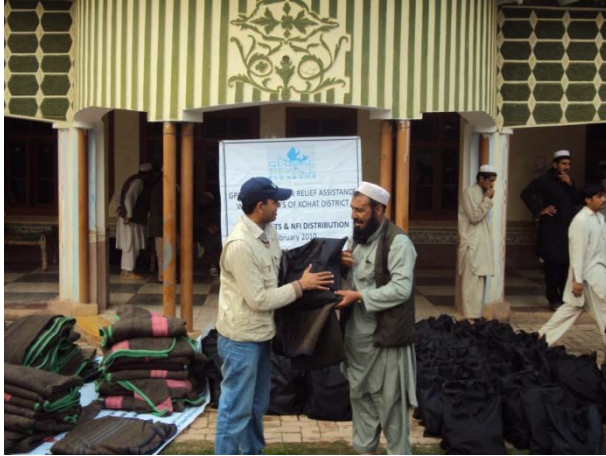
IDP from Orakazi Agency receiving NFI Kit