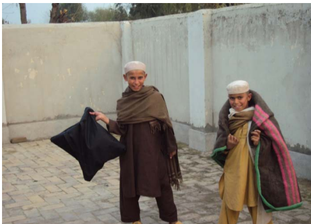
Brothers after receiving NFI Kit and Blanket from GPP