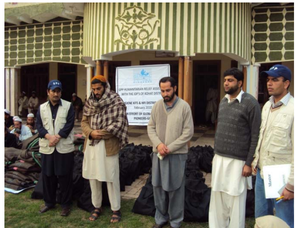
GPP Staff & Rep of Social Welfare Office, Kohat at Opening prayer in Distribution of NFI Kits