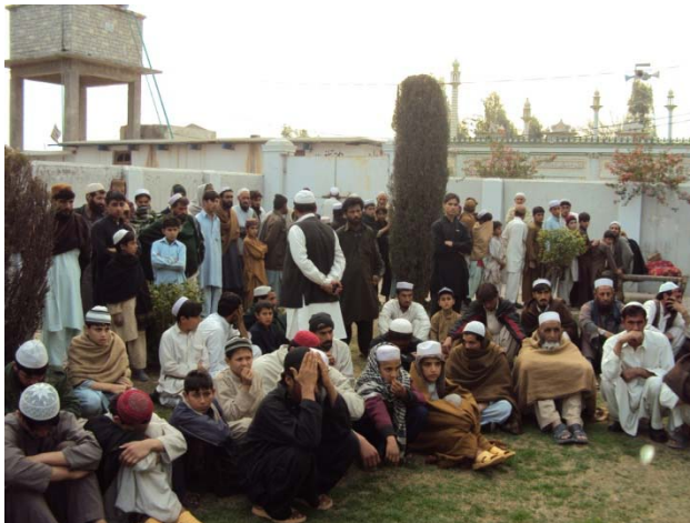
IDPs gathered for NFI Kit distribution by GPP