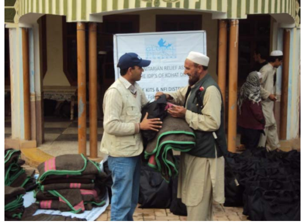
IDP from Orakzai Agency receiving NFI Kit