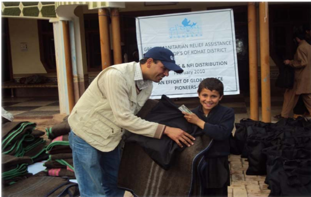
NFI & Blankets Distribution with the IDPs of Orakzai Agency In Kohat District February 2010