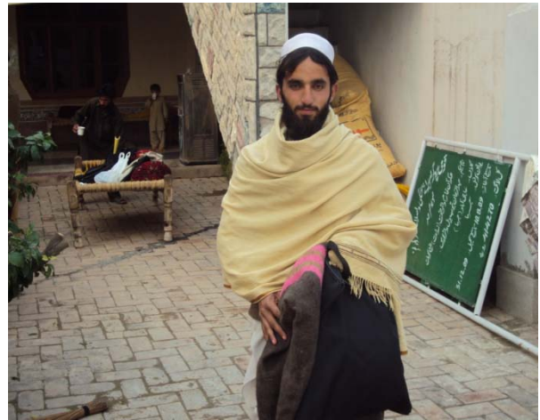
IDP at the distribution point