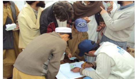
Registration of the IDPs in Kohat by GPP Staff

In response to the one day assessment GPP team along with the assistance of District Social Welfare office team visited Jurmah UC in Kohat district. The said district is considered to host more than 50 % of the IDPs population. The assessment tools consisted essentially of open-ended questions regarding the facility information, access indicators, physical infrastructure, staffing positions, and supplies, reporting, and the effect of population movements regarding food items, hygiene kits and student studying kits.